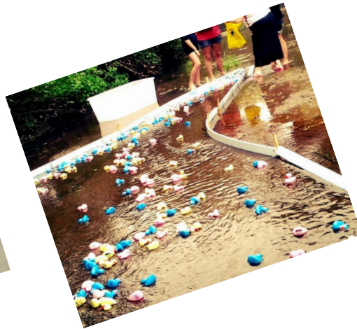
What a great time at the Duck Race!! Proceeds from this event provided funds for utility shut off notices.