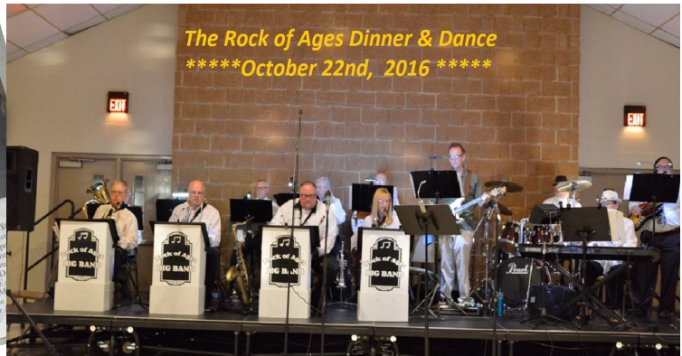
The Rock of Ages Dinner & Dance *****October 22nd, 2016 *****