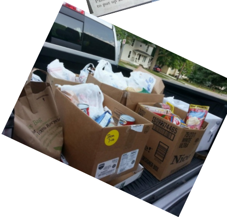
Only one of the many loads from the Davison post office in the "Stamp Out Hunger" Food Drive!